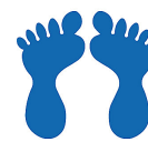
Foot 120 x 210mm